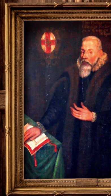
The Great Hall