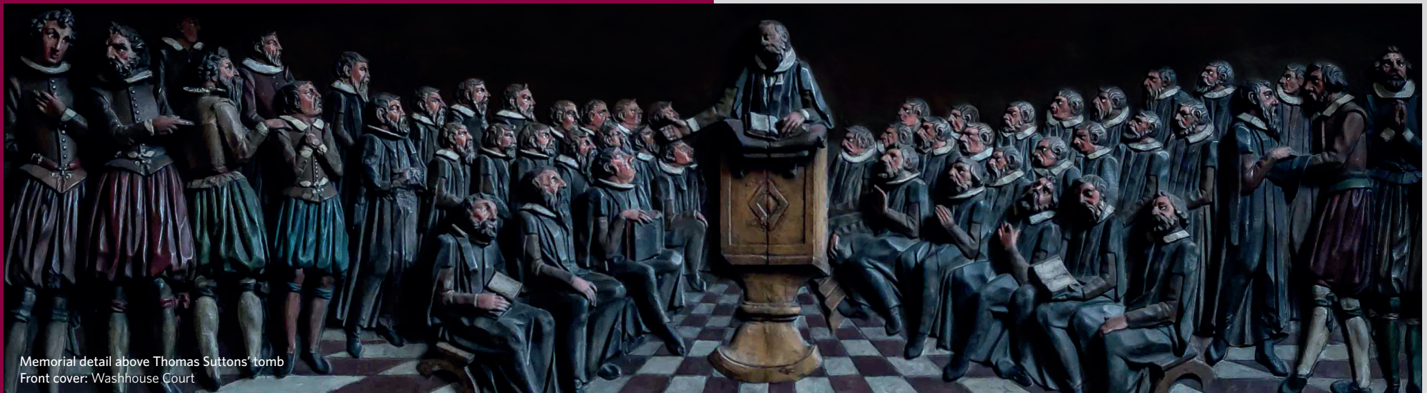
Memorial detail above Thomas Suttons' tomb Front cover: Washhouse Court

Our charitable mission is to provide support, care and wellbeing for older adults in need, whilst preserving and sharing our heritage for future generations. The provision made by Thomas Sutton in 1611 still provides for our residents but the ever- increasing costs of supporting our ageing community and the ancient buildings means that we must generate further income.